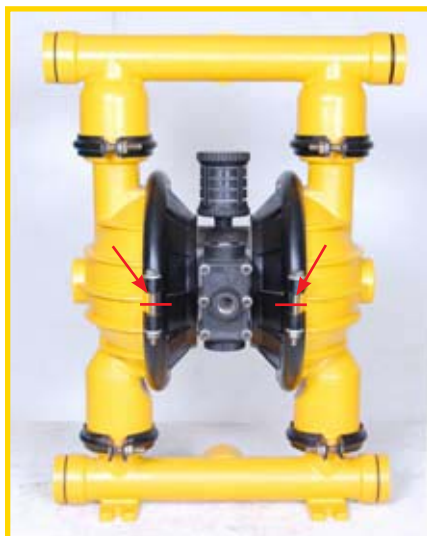
STEP 1 (Fig 1)

Before starting disassembly, mark a line from each liquid chamber to its corresponding air chamber. This line will assist in proper alignment during reassembly. (Fig 1)