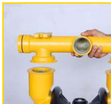
STEP 6 (Fig 6)

Lift away the discharge manifold to expose the valve balls and seats. (Fig 3)