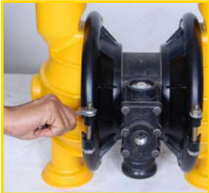
STEP 9 (Fig 9)

Remove one set of large clamp bands, which secure one liquid chamber to the center section. (Fig 9)