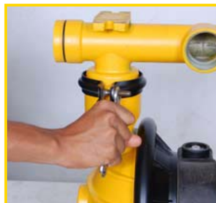
STEP 5 (Fig 5)

Utilizing a wrench, remove the two small clamp bands that fasten the discharge manifold to the liquid chambers. (Fig 2)