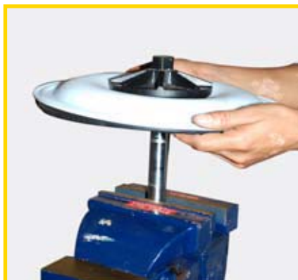
STEP 13 (Fig 14)

To remove diaphragm assembly from shaft, secure shaft with soft jaws (a vise fitted with plywood or other suitable material) to ensure shaft is not nicked, scratched, or gouged. Using an adjustable wrench or by hand, remove diaphragm assembly from shaft. Inspect all parts for wear and replace with genuine PRICE parts if necessary. (Fig 14)