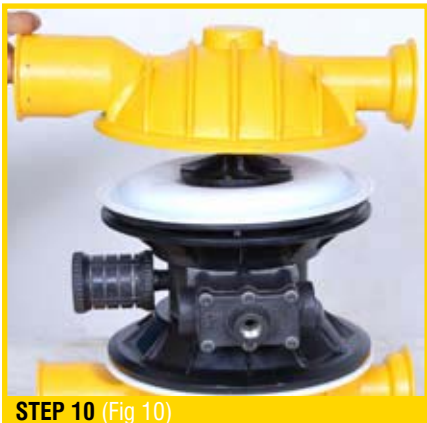
STEP 10 (Fig 10)

Remove one set of large clamp bands, which secure one liquid chamber to the center section. (Fig 9)