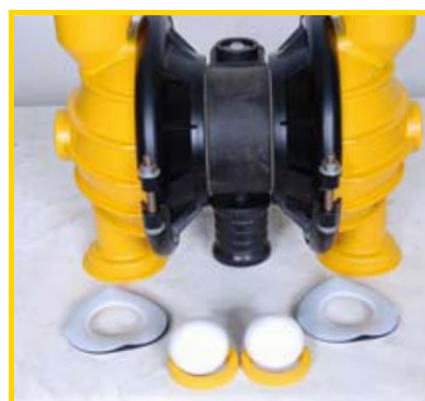
STEP 7 (Fig 7)

Remove the discharge valve balls, O-rings and seats (Fig 4) from the liquid chambers and inspect for nicks, gouges, chemical attack or abrasive wear. Replace worn parts with genuine PRICE parts for reliable performance.