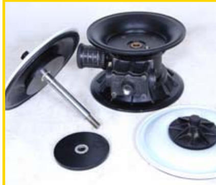
STEP 12 (Fig 12)

Using an adjustable wrench, or by rotating the diaphragm by hand, remove the diaphragm assembly. (Fig 11)