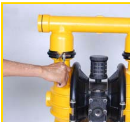
STEP 2 (Fig 2)

Before starting disassembly, mark a line from each liquid chamber to its corresponding air chamber. This line will assist in proper alignment during reassembly. (Fig 1)