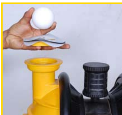
STEP 4 (Fig 4)

Lift suction manifold from liquid chambers and centre section to expose suction valve balls and seats. Inspect ball cage area of liquid chamber for excessive wear and damage. (Fig 6)