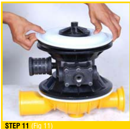
STEP 11 (Fig 11)

Lift liquid chamber away from center section to expose diaphragm and outer piston. (Fig 10)