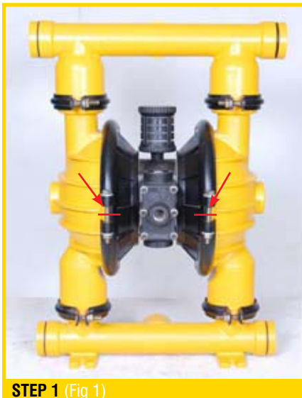
STEP 1 (Fig 1)

Before starting disassembly, mark a line from each liquid chamber to its corresponding air chamber. This line will assist in proper alignment during reassembly. (Fig 1)