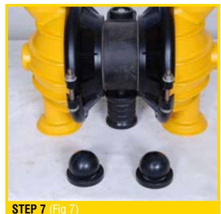
STEP 7 (Fig 7)

Remove the discharge valve balls, O-rings and seats (Fig 4) from the liquid chambers and inspect for nicks, gouges, chemical attack or abrasive wear. Replace worn parts with genuine PRICE parts for reliable performance.