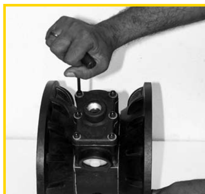
STEP 6 (Fig 6)

Remove the diaphragm & lock nut If diaphragm are damaged replace them (always replace both the diaphragm). (Fig 3)