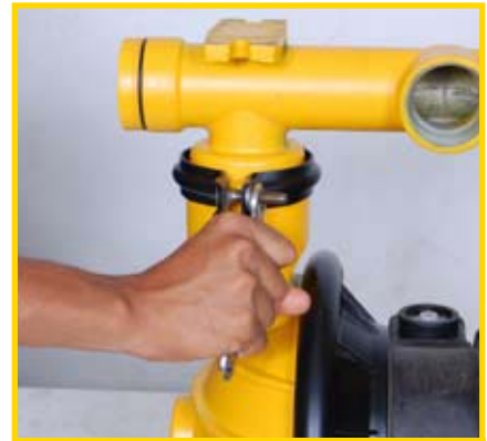
STEP 5 (Fig 5)

Utilizing a wrench, remove the two small clamp bands that fasten the discharge manifold to the liquid chambers. (Fig 2)