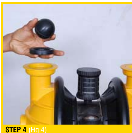
STEP 4 (Fig 4)

Lift suction manifold from liquid chambers and centre section to expose suction valve balls and seats. Inspect ball cage area of liquid chamber for excessive wear and damage. (Fig 6)