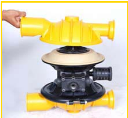
STEP 10 (Fig 10)

Remove one set of large clamp bands, which secure one liquid chamber to the center section. (Fig 9)