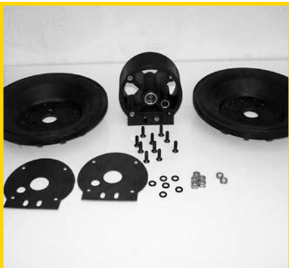
STEP 13 (Fig 13)

Unscrew the allen bolts to remove the air cover.