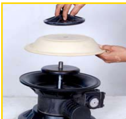
STEP 3 (Fig 3)

Remove pilot shaft by unscrewing two nylock nuts if found damage replace them. (Fig 5)