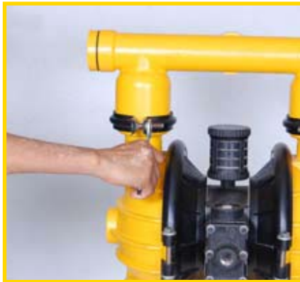
STEP 2 (Fig 2)

Before starting disassembly, mark a line from each liquid chamber to its corresponding air chamber. This line will assist in proper alignment during reassembly. (Fig 1)