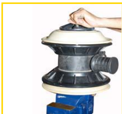
STEP 1 (Fig 1)

Fix the lock nut (outer piston) on the wise.