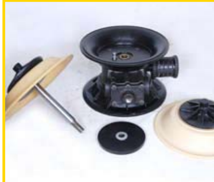
STEP 12 (Fig 12)

Using an adjustable wrench, or by rotating the diaphragm by hand, remove the diaphragm assembly. (Fig 11)