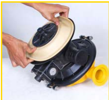
STEP 11 (Fig 11)

Lift liquid chamber away from center section to expose diaphragm and outer piston. (Fig 10)