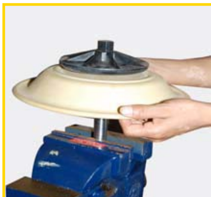
STEP 13 (Fig 14)

To remove diaphragm assembly from shaft, secure shaft with soft jaws (a vise fitted with plywood or other suitable material) to ensure shaft is not nicked, scratched, or gouged. Using an adjustable wrench or by hand, remove diaphragm assembly from shaft. Inspect all parts for wear and replace with genuine PRICE parts if necessary. (Fig 14)