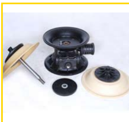
STEP 4 (Fig 4)

Fix the lock nut (outer piston) on the wise.