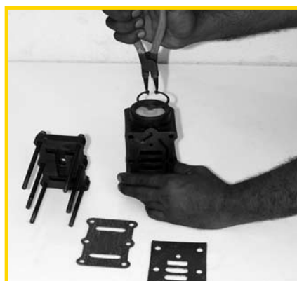
STEP 7 (Fig 7)

Now check the centre block i.e. air valve with air cover Take out main shaft, replace If worn out or scored. Check shaft block bush 'O' rings, replace If worn out. (Fig 4)