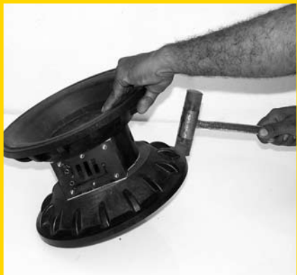
STEP 11 (Fig 11)

Take out the piston block cap by using mounting bolts. Check the cap with 'O' ring. (Fig 8)