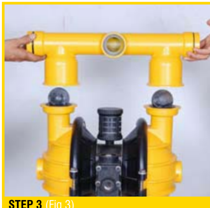
STEP 3 (Fig 3)

Remove the two small clamp bands which fasten the suction manifold to the liquid chambers. (Fig 5)