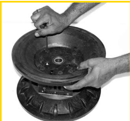
STEP 10 (Fig 10)

Remove the pilot shaft bushes and check it. Check the O rings, replace if worn out. (Fig 12)