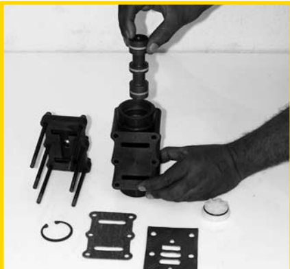
STEP 9 (Fig 9)

Remove air cover and check the gaskets. (Fig 11)