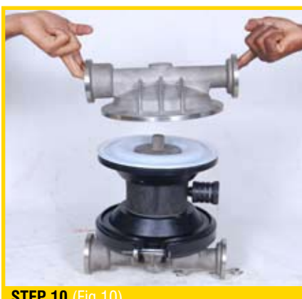
STEP 10 (Fig 10)

NOTE: Due to varying torque values, one of the following two situations may occur: 1) The lock nut (outer piston), diaphragm and holding plate (inner piston) remain attached to the shaft and the entire assembly can be removed from the center section (Fig 12). 2) The lock nut (outer piston), diaphragm and holding plate (inner piston) separate from the shaft which remains connected to the opposite side diaphragm assembly (Fig 13). Repeat disassembly instructions for the opposite liquid chamber. Inspect diaphragm assembly and shaft for signs of wear or chemical attack. Replace all worn parts with genuine PRICE parts for reliable performance.