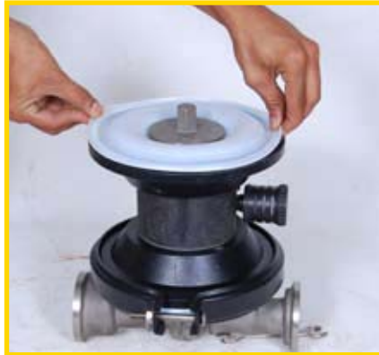
STEP 11 (Fig 11)

Normally inlet and discharge manifolds should not be disassembled during regular pump maintenance. Should this be necessary, completely remove clamp bands and inspect O-rings for nicks, cuts and chemical attack. (Fig 8)