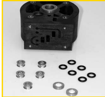
STEP 11 (Fig 11)

Remove the piston. Check Piston rings. Clean the piston with solvent. (Fig 8)