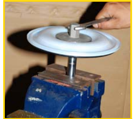
STEP 13 (Fig 14)

Using an adjustable wrench, or by rotating the diaphragm by hand, remove the diaphragm assembly. (Fig 11)