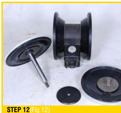
STEP 12 (Fig 12)

Remove one set of large clamp bands, which secure one liquid chamber to the center section. (Fig 9)