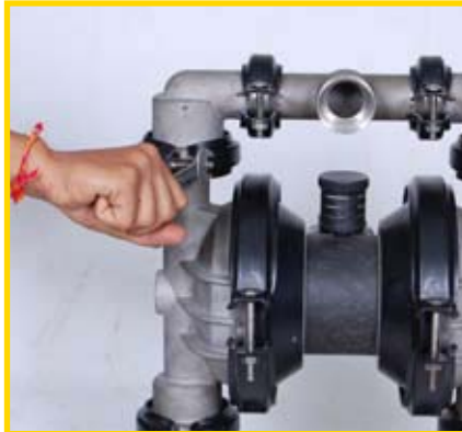
STEP 2 (Fig 2)

Before starting disassembly, mark a line from each liquid chamber to its corresponding air chamber. This line will assist in proper alignment during reassembly. (Fig 1)