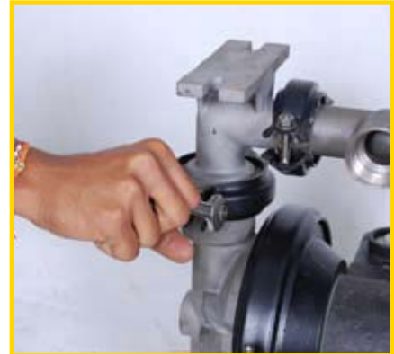
STEP 5 (Fig 5)

Utilizing a wrench, remove the two small clamp bands that fasten the discharge manifold to the liquid chambers. (Fig 2)