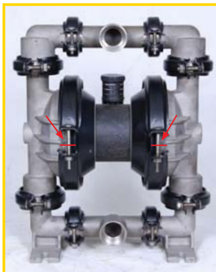
STEP 1 (Fig 1)

Before starting disassembly, mark a line from each liquid chamber to its corresponding air chamber. This line will assist in proper alignment during reassembly. (Fig 1)