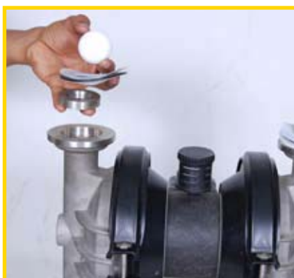
STEP 4 (Fig 4)

Lift suction manifold from liquid chambers and centre section to expose suction valve balls and seat. Inspect ball cage area of liquid chamber for excessive wear and damage. (Fig 6)