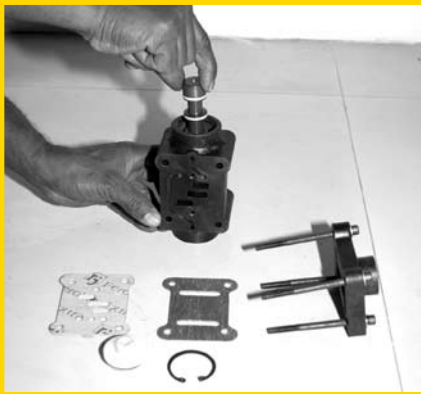
STEP 8 (Fig 8)

Remove the piston. Check Piston rings. Clean the piston with solvent. (Fig 8)