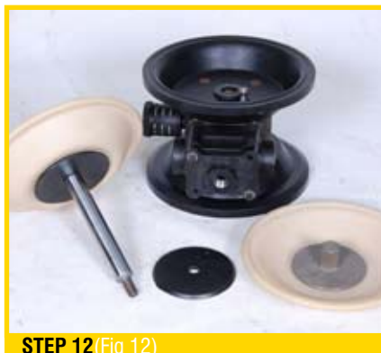
STEP 12 (Fig 12)

Remove one set of large clamp bands, which secure one liquid chamber to the center section. (Fig 9)