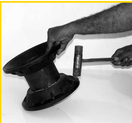
STEP 9 (Fig 9)

Pilot bushes with rings and 'O' rings. (Fig 11)