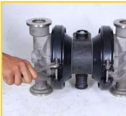
STEP 9 (Fig 9)

To remove diaphragm assembly from shaft, secure shaft with soft jaws (a vise fitted with plywood or other suitable material) to ensure shaft is not nicked, scratched, or gouged. Using an adjustable wrench or by hand, remove diaphragm assembly from shaft. Inspect all parts for wear and replace with genuine PRICE parts if necessary. (Fig 14)