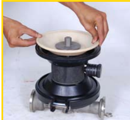
STEP 11 (Fig 11)

Normally inlet and discharge manifolds should not be disassembled during regular pump maintenance. Should this be necessary, completely remove clamp bands and inspect O-rings for nicks, cuts and chemical attack. (Fig 8)