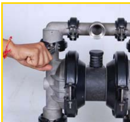
STEP 2 (Fig 2)

Before starting disassembly, mark a line from each liquid chamber to its corresponding air chamber. This line will assist in proper alignment during reassembly. (Fig 1)