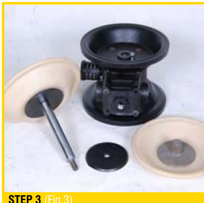
STEP 3 (Fig 3)

Remove the piston block from the shaft block by opening the 4 holding bolts. (Fig 5)