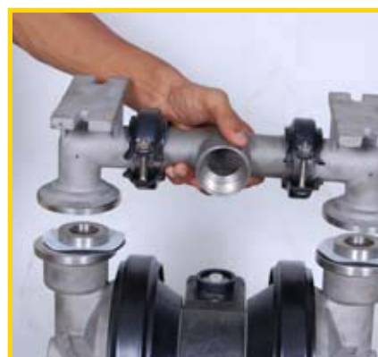
STEP 6 (Fig 6)

Lift away the discharge manifold to expose the valve balls and seats. (Fig 3)