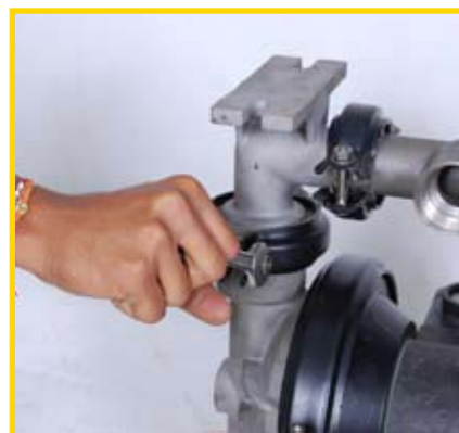
STEP 5 (Fig 5)

Utilizing a wrench, remove the two small clamp bands that fasten the discharge manifold to the liquid chambers. (Fig 2)