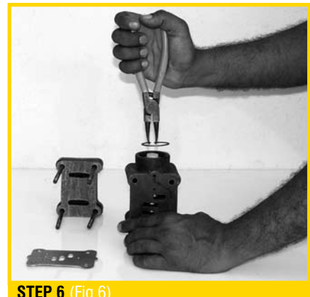
STEP 6 (Fig 6)

Now check the centre block i.e. air valve with air cover. Take out main shaft, replace if worn out or scored. Check shaft block bush 'O' rings, replace if worn out. (Fig 3)