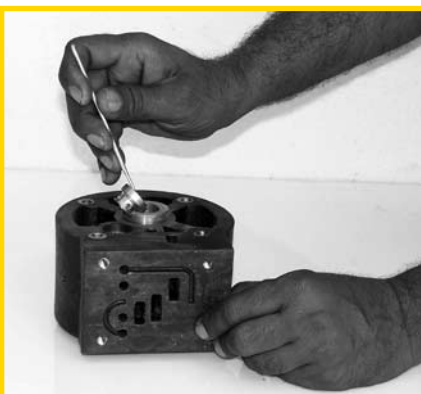
STEP 10 (Fig 10)

Check the air covers and shaft block gaskets. If found damaged, replace them.