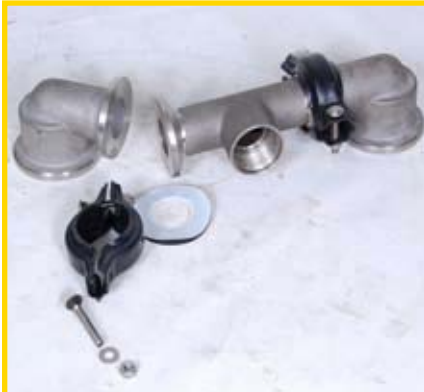
STEP 8 (Fig 8)

Normally inlet and discharge manifolds should not be disassembled during regular pump maintenance. Should this be necessary, completely remove clamp bands and inspect O-rings for nicks, cuts and chemical attack. (Fig 8)