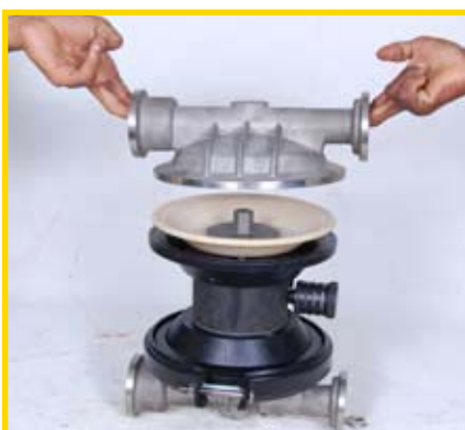
STEP 10 (Fig 10)

NOTE: Due to varying torque values, one of the following two situations may occur: 1) The lock nut (outer piston), diaphragm and holding plate (inner piston) remain attached to the shaft and the entire assembly can be removed from the center section (Fig 12). 2) The lock nut (outer piston), diaphragm and holding plate (inner piston) separate from the shaft which remains connected to the opposite side diaphragm assembly (Fig 13). Repeat disassembly instructions for the opposite liquid chamber. Inspect diaphragm assembly and shaft for signs of wear or chemical attack. Replace all worn parts with genuine PRICE parts for reliable performance.