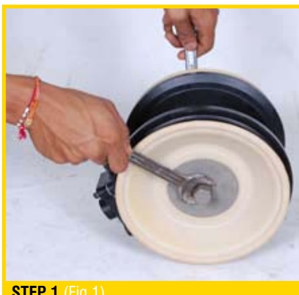
STEP 1 (Fig 1)

Remove the locknuts (outer piston) with the help of a Bench vice.