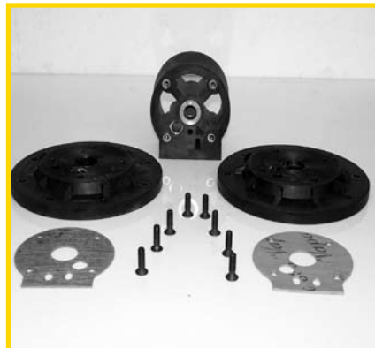
STEP 12 (Fig 12)

Remove air cover if required. Change gasket if Required. (Fig 9)