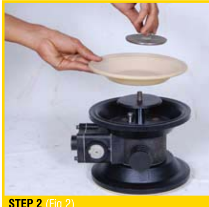
STEP 2 (Fig 2)

Remove the diaphragm & lock nut. If diaphragm are damaged replace them (always replace both the diaphragm). (Fig 2)