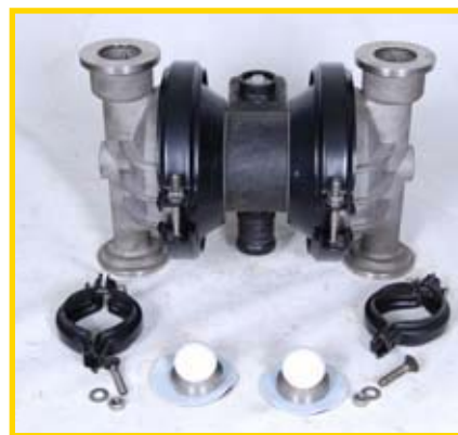
STEP 7 (Fig 7)

Remove the discharge valve balls, O-rings and seats (Fig 4) from the liquid chambers and inspect for nicks, gouges, chemical attack or abrasive wear. Replace worn parts with genuine PRICE parts for reliable performance.