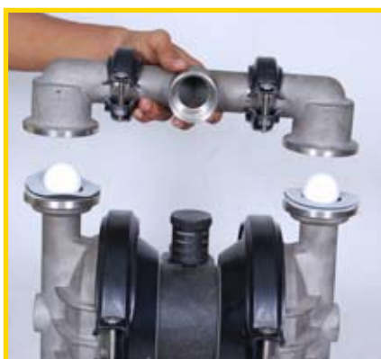
STEP 3 (Fig 3)

Remove the two small clamp bands which fasten the suction manifold to the liquid chambers. (Fig 5)