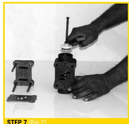
STEP 7 (Fig 7)

Remove pilot shaft by unscrewing two nylock nuts if found damage replace them. (Fig 4)