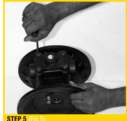
STEP 5 (Fig 5)

Remove the diaphragm & lock nut. If diaphragm are damaged replace them (always replace both the diaphragm). (Fig 2)