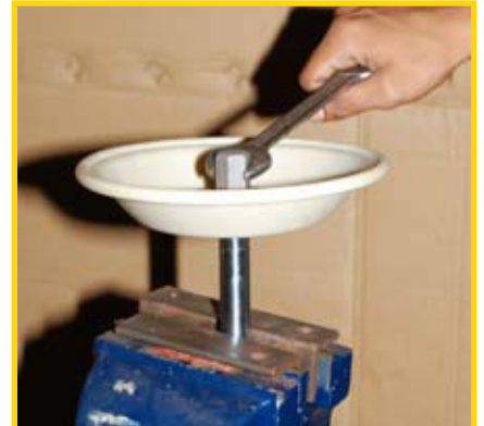
STEP 13 (Fig 14)

Using an adjustable wrench, or by rotating the diaphragm by hand, remove the diaphragm assembly. (Fig 11)