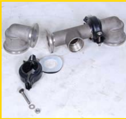
STEP 8 (Fig 8)

Normally inlet and discharge manifolds should not be disassembled during regular pump maintenance. Should this be necessary, completely remove clamp bands and inspect O-rings for nicks, cuts and chemical attack. (Fig 8)