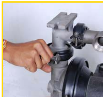
STEP 5 (Fig 5)

Utilizing a wrench, remove the two small clamp bands that fasten the discharge manifold to the liquid chambers. (Fig 2)