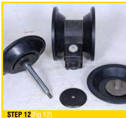
STEP 12 (Fig 12)

Remove one set of large clamp bands, which secure one liquid chamber to the center section. (Fig 9)