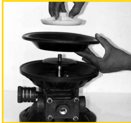
STEP 2 (Fig 2)

Remove the diaphragm & lock nut. If diaphragm are damaged replace them (always replace both the diaphragm). (Fig 2)