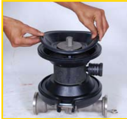
STEP 11 (Fig 11)

Normally inlet and discharge manifolds should not be disassembled during regular pump maintenance. Should this be necessary, completely remove clamp bands and inspect O-rings for nicks, cuts and chemical attack. (Fig 8)