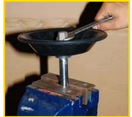
STEP 13 (Fig 14)

Using an adjustable wrench, or by rotating the diaphragm by hand, remove the diaphragm assembly. (Fig 11)