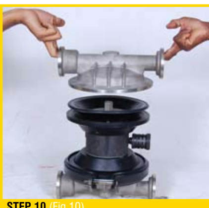
STEP 10 (Fig 10)

NOTE: Due to varying torque values, one of the following two situations may occur: 1) The lock nut (outer piston), diaphragm and holding plate (inner piston) remain attached to the shaft and the entire assembly can be removed from the center section (Fig 12). 2) The lock nut (outer piston), diaphragm and holding plate (inner piston) separate from the shaft which remains connected to the opposite side diaphragm assembly (Fig 13). Repeat disassembly instructions for the opposite liquid chamber. Inspect diaphragm assembly and shaft for signs of wear or chemical attack. Replace all worn parts with genuine PRICE parts for reliable performance.