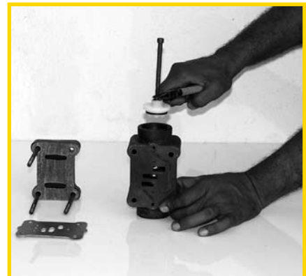
STEP 7 (Fig 7)

Remove pilot shaft by unscrewing two nylock nuts if found damage replace them. (Fig 4)