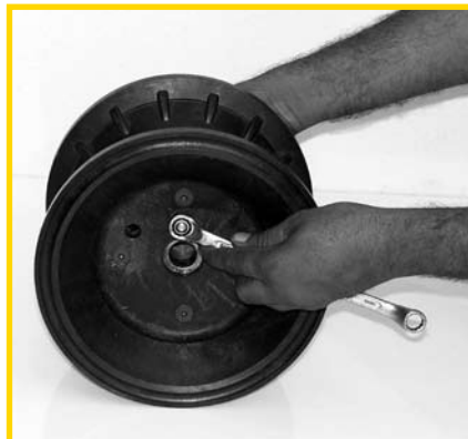
STEP 4 (Fig 4)

Remove the locknuts (outer piston) with the help of a Bench vice.