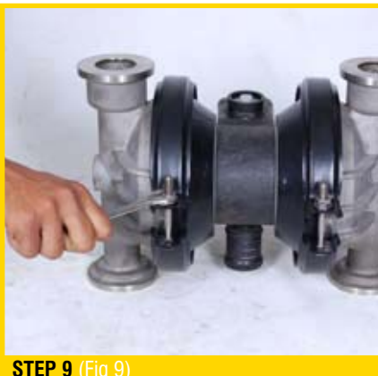
STEP 9 (Fig 9)

To remove diaphragm assembly from shaft, secure shaft with soft jaws (a vise fitted with plywood or other suitable material) to ensure shaft is not nicked, scratched, or gouged. Using an adjustable wrench or by hand, remove diaphragm assembly from shaft. Inspect all parts for wear and replace with genuine PRICE parts if necessary. (Fig 14)