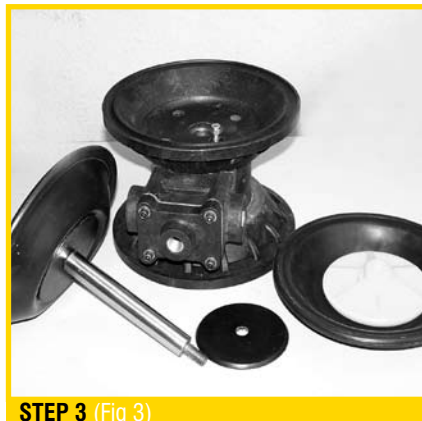
STEP 3 (Fig 3)

Remove the piston block from the shaft block by opening the 4 holding bolts. (Fig 5)