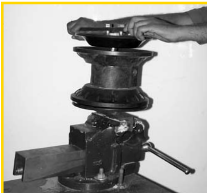
STEP 1 (Fig 1)

Remove the locknuts (outer piston) with the help of a Bench vice.