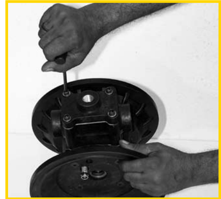
STEP 5 (Fig 5)

Remove the diaphragm & lock nut. If diaphragm are damaged replace them (always replace both the diaphragm). (Fig 2)