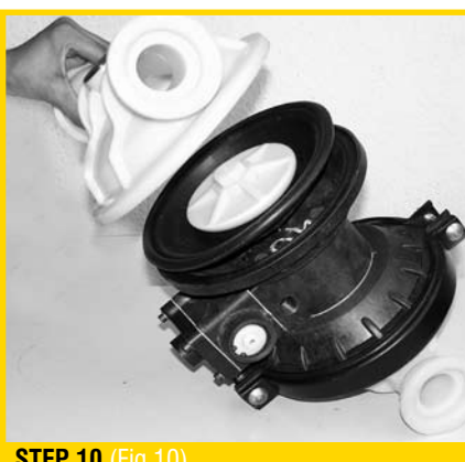
STEP 10 (Fig 10)

NOTE: Due to varying torque values, one of the following two situations may occur: 1) The lock nut (outer piston), diaphragm and holding plate (inner piston) remain attached to the shaft and the entire assembly can be removed from the center section (Fig 12). 2) The lock nut (outer piston), diaphragm and holding plate (inner piston) separate from the shaft which remains connected to the opposite side diaphragm assembly (Fig 13). Repeat disassembly instructions for the opposite liquid chamber. Inspect diaphragm assembly and shaft for signs of wear or chemical attack. Replace all worn parts with genuine PRICE parts for reliable performance.