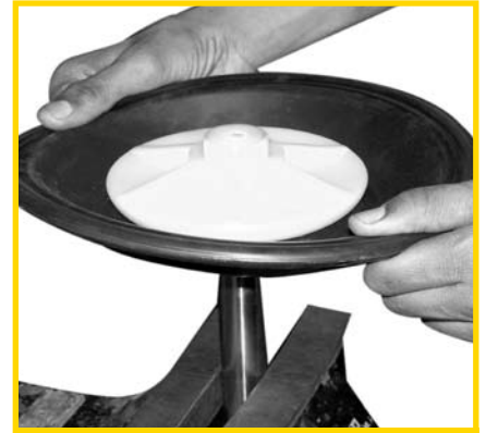
STEP 13 (Fig 14)

Using an adjustable wrench, or by rotating the diaphragm by hand, remove the diaphragm assembly. (Fig 11)