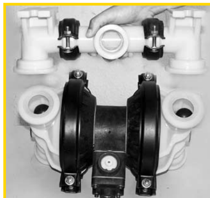
STEP 6 (Fig 6)

Lift away the discharge manifold to expose the valve balls and seats. (Fig 3)