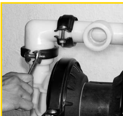
STEP 2 (Fig 2)

Before starting disassembly, mark a line from each liquid chamber to its corresponding air chamber. This line will assist in proper alignment during reassembly. (Fig 1)