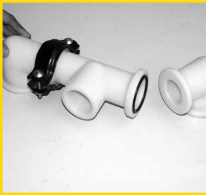
STEP 8 (Fig 8)

Normally inlet and discharge manifolds should not be disassembled during regular pump maintenance. Should this be necessary, completely remove clamp bands and inspect O-rings for nicks, cuts and chemical attack. (Fig 8)