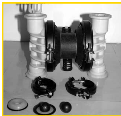
STEP 7 (Fig 7)

Remove the discharge valve balls, O-rings and seats (Fig 4) from the liquid chambers and inspect for nicks, gouges, chemical attack or abrasive wear. Replace worn parts with genuine PRICE parts for reliable performance.