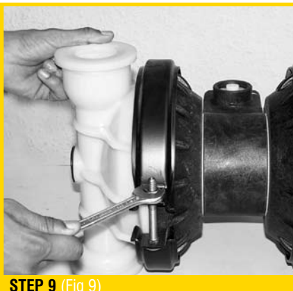
STEP 9 (Fig 9)

To remove diaphragm assembly from shaft, secure shaft with soft jaws (a vise fitted with plywood or other suitable material) to ensure shaft is not nicked, scratched, or gouged. Using an adjustable wrench or by hand, remove diaphragm assembly from shaft. Inspect all parts for wear and replace with genuine PRICE parts if necessary. (Fig 14)