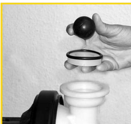
STEP 4 (Fig 4)

Lift suction manifold from liquid chambers and centre section to expose suction valve balls and seat. Inspect ball cage area of liquid chamber for excessive wear and damage. (Fig 6)