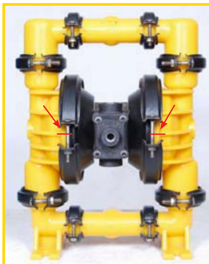
STEP 1 (Fig 1)

Before starting disassembly, mark a line from each liquid chamber to its corresponding air chamber. This line will assist in proper alignment during reassembly. (Fig 1)