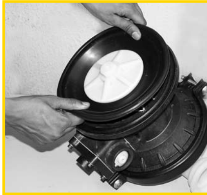
STEP 11 (Fig 11)

Normally inlet and discharge manifolds should not be disassembled during regular pump maintenance. Should this be necessary, completely remove clamp bands and inspect O-rings for nicks, cuts and chemical attack. (Fig 8)