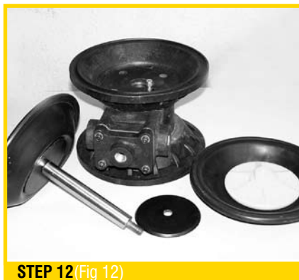
STEP 12 (Fig 12)

Remove one set of large clamp bands, which secure one liquid chamber to the center section. (Fig 9)