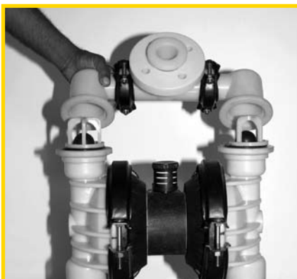
STEP 3 (Fig 3)

Remove the two small clamp bands which fasten the suction manifold to the liquid chambers. (Fig 5)