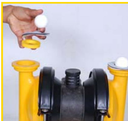
STEP 4 (Fig 4)

Lift away the discharge manifold to expose the valve balls and seats. (Fig 3)