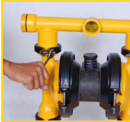
STEP 2 (Fig 2)

Before starting disassembly, mark a line from each liquid chamber to its corresponding air chamber. This line will assist in proper alignment during reassembly. (Fig 1)