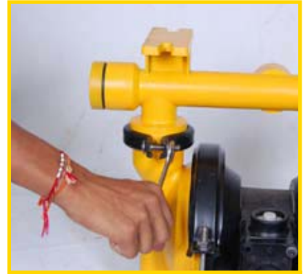
STEP 5 (Fig 5)

Remove the discharge valve balls, O-rings and seats (Fig 4) from the liquid chambers and inspect for nicks, gouges, chemical attack or abrasive wear. Replace worn parts with genuine PRICE parts for reliable performance.