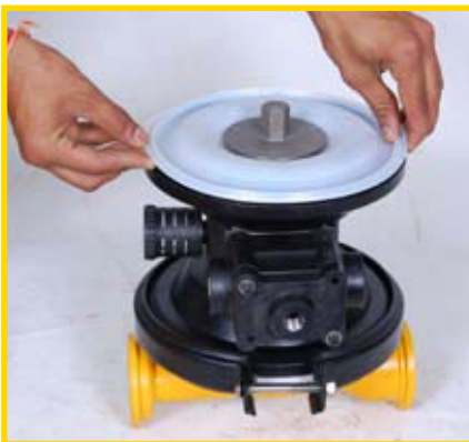
STEP 10 (Fig 10)

Lift liquid chamber away from center section to expose diaphragm and outer piston. (Fig 10)