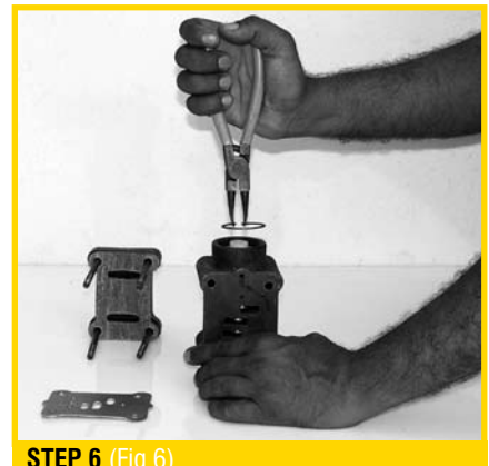
STEP 6 (Fig 6)

Now check the centre block i.e. air valve with air cover. Take out main shaft, replace if worn out or scored. Check shaft block bush 'O' rings, replace if worn out. (Fig 3)