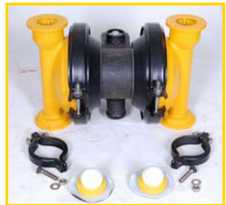
STEP 7 (Fig 7)

Lift suction manifold from liquid chambers and centre section to expose suction valve balls and seat. Inspect ball cage area of liquid chamber for excessive wear and damage. (Fig 6)