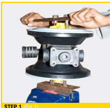
STEP 1 (Fig 1)

Remove the locknuts (outer piston) with the help of a Bench vice.