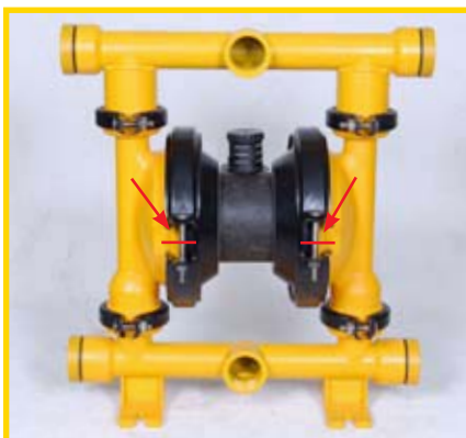
STEP 1 (Fig 1)

Before starting disassembly, mark a line from each liquid chamber to its corresponding air chamber. This line will assist in proper alignment during reassembly. (Fig 1)