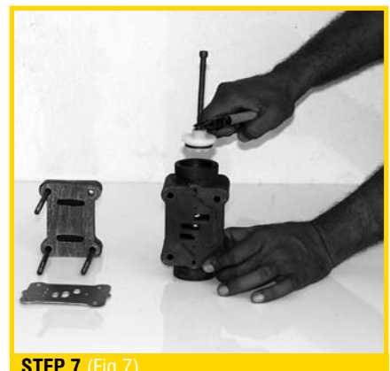
STEP 7 (Fig 7)

Remove pilot shaft by unscrewing two nylock nuts if found damage replace them. (Fig 4)