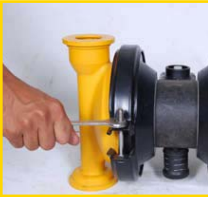
STEP 8 (Fig 8)

Remove one set of large clamp bands, which secure one liquid chamber to the center section. (Fig 9)