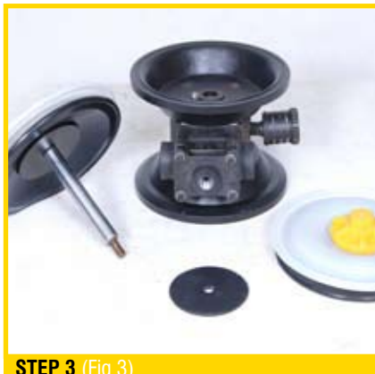
STEP 3 (Fig 3)

Remove the piston block from the shaft block by opening the 4 holding bolts. (Fig 5)