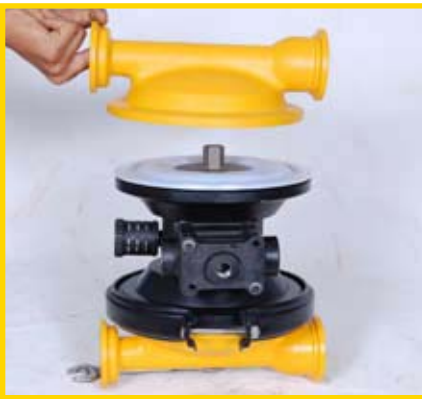
STEP 9 (Fig 9)

Remove one set of large clamp bands, which secure one liquid chamber to the center section. (Fig 9)