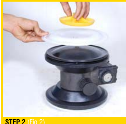
STEP 2 (Fig 2)

Remove the diaphragm & lock nut. If diaphragm are damaged replace them (always replace both the diaphragm). (Fig 2)