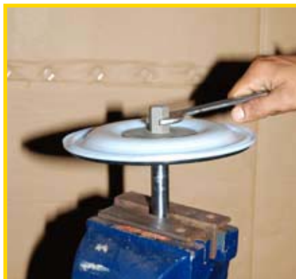
STEP 12 (Fig 12)

To remove diaphragm assembly from shaft, secure shaft with soft jaws (a vise fitted with plywood or other suitable material) to ensure shaft is not nicked, scratched, or gouged. Using an adjustable wrench or by hand, remove diaphragm assembly from shaft. Inspect all parts for wear and replace with genuine PRICE parts if necessary. (Fig 14)