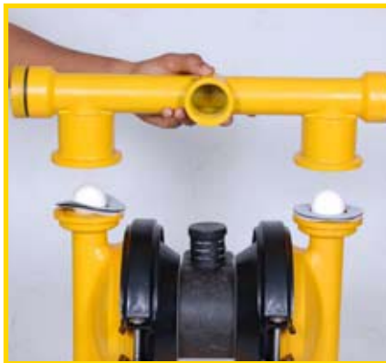
STEP 3 (Fig 3)

Utilizing a wrench, remove the two small clamp bands that fasten the discharge manifold to the liquid chambers. (Fig 2)