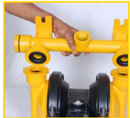
STEP 6 (Fig 6)

Remove the two small clamp bands which fasten the suction manifold to the liquid chambers. (Fig 5)