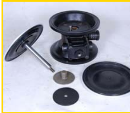
STEP 11 (Fig 11)

Using an adjustable wrench, or by rotating the diaphragm by hand, remove the diaphragm assembly. (Fig 11)