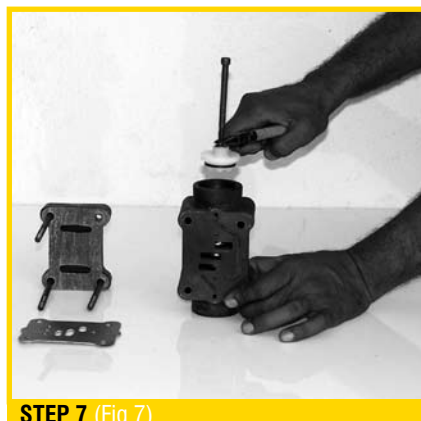
STEP 7 (Fig 7)

Remove pilot shaft by unscrewing two nylock nuts if found damage replace them. (Fig 4)