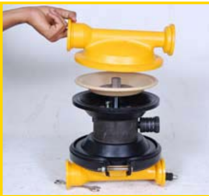
STEP 9 (Fig 9)

Remove one set of large clamp bands, which secure one liquid chamber to the center section. (Fig 9)