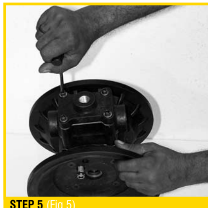
STEP 5 (Fig 5)

Remove the diaphragm & lock nut. If diaphragm are damaged replace them (always replace both the diaphragm). (Fig 2)