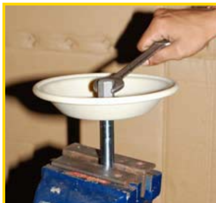
STEP 12 (Fig 12)

To remove diaphragm assembly from shaft, secure shaft with soft jaws (a vise fitted with plywood or other suitable material) to ensure shaft is not nicked, scratched, or gouged. Using an adjustable wrench or by hand, remove diaphragm assembly from shaft. Inspect all parts for wear and replace with genuine PRICE parts if necessary. (Fig 14)