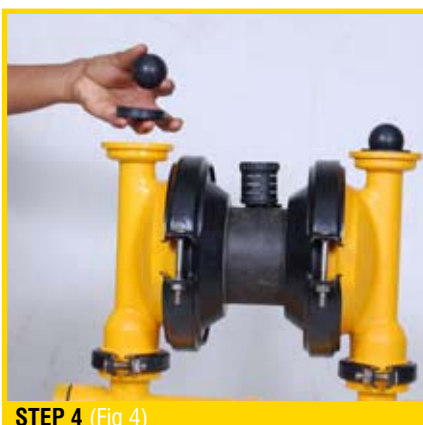
STEP 4 (Fig 4)

Before starting disassembly, mark a line from each liquid chamber to its corresponding air chamber. This line will assist in proper alignment during reassembly. (Fig 1)