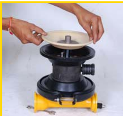
STEP 10 (Fig 10)

Lift liquid chamber away from center section to expose diaphragm and outer piston. (Fig 10)