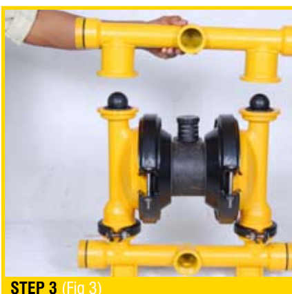
STEP 3 (Fig 3)

Remove the two small clamp bands which fasten the suction manifold to the liquid chambers. (Fig 5)