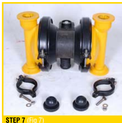
STEP 7 (Fig 7)

Remove the discharge valve balls, O-rings and seats (Fig 4) from the liquid chambers and inspect for nicks, gouges, chemical attack or abrasive wear. Replace worn parts with genuine PRICE parts for reliable performance.