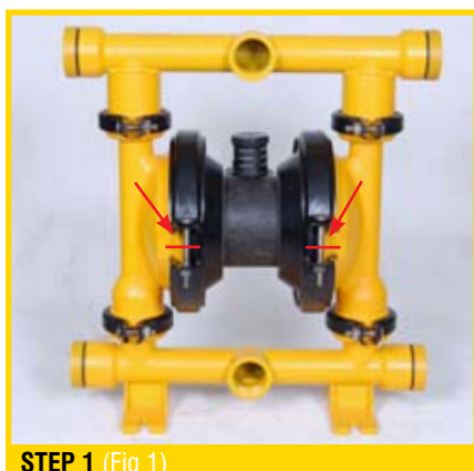
STEP 1 (Fig 1)

Before starting disassembly, mark a line from each liquid chamber to its corresponding air chamber. This line will assist in proper alignment during reassembly. (Fig 1)