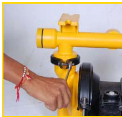
STEP 5 (Fig 5)

Utilizing a wrench, remove the two small clamp bands that fasten the discharge manifold to the liquid chambers. (Fig 2)