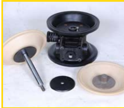
STEP 11 (Fig 11)

Using an adjustable wrench, or by rotating the diaphragm by hand, remove the diaphragm assembly. (Fig 11)