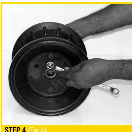
STEP 4 (Fig 4)

Remove the locknuts (outer piston) with the help of a Bench vice.