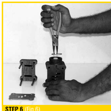
STEP 6 (Fig 6)

Now check the centre block i.e. air valve with air cover. Take out main shaft, replace if worn out or scored. Check shaft block bush 'O' rings, replace if worn out. (Fig 3)