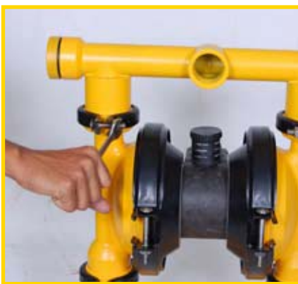
STEP 2 (Fig 2)

Utilizing a wrench, remove the two small clamp bands that fasten the discharge manifold to the liquid chambers. (Fig 2)