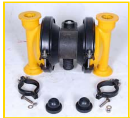
STEP 7 (Fig 7)

Lift suction manifold from liquid chambers and centre section to expose suction valve balls and seat. Inspect ball cage area of liquid chamber for excessive wear and damage. (Fig 6)