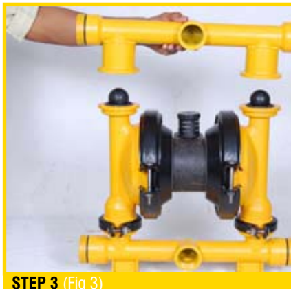
STEP 3 (Fig 3)

Utilizing a wrench, remove the two small clamp bands that fasten the discharge manifold to the liquid chambers. (Fig 2)