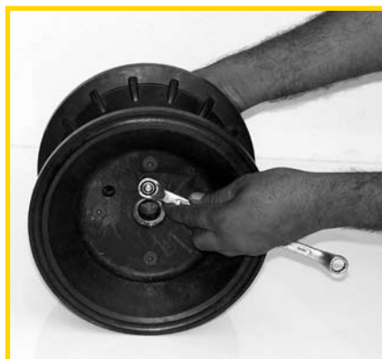
STEP 4 (Fig 4)

Remove the locknuts (outer piston) with the help of a Bench vice.