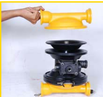
STEP 9 (Fig 9)

Remove one set of large clamp bands, which secure one liquid chamber to the center section. (Fig 9)