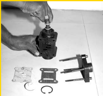
STEP 8 (Fig 8)

Remove the piston. Check Piston rings. Clean the piston with solvent. (Fig 8)