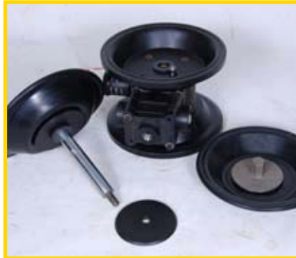
STEP 11 (Fig 11)

Using an adjustable wrench, or by rotating the diaphragm by hand, remove the diaphragm assembly. (Fig 11)