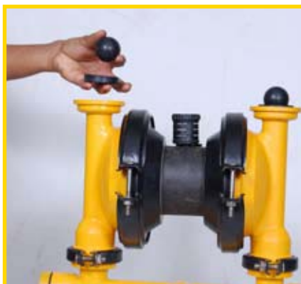
STEP 4 (Fig 4)

Lift away the discharge manifold to expose the valve balls and seats. (Fig 3)