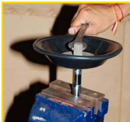
STEP 12 (Fig 12)

To remove diaphragm assembly from shaft, secure shaft with soft jaws (a vise fitted with plywood or other suitable material) to ensure shaft is not nicked, scratched, or gouged. Using an adjustable wrench or by hand, remove diaphragm assembly from shaft. Inspect all parts for wear and replace with genuine PRICE parts if necessary. (Fig 14)