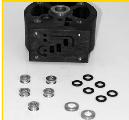
STEP 11 (Fig 11)

Remove the piston. Check Piston rings. Clean the piston with solvent. (Fig 8)