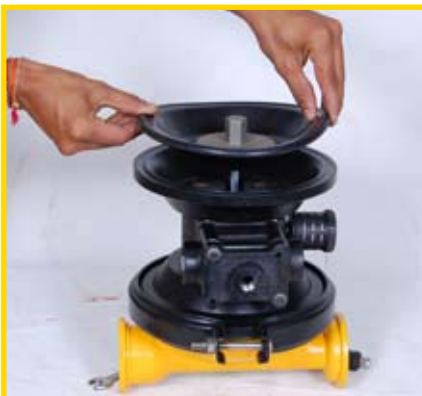
STEP 10 (Fig 10)

Lift liquid chamber away from center section to expose diaphragm and outer piston. (Fig 10)