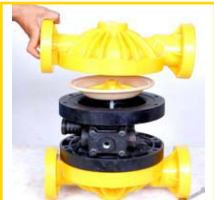
STEP 10 (Fig 10)

Remove one set of large clamp bands, which secure one liquid chamber to the center section. (Fig 9)