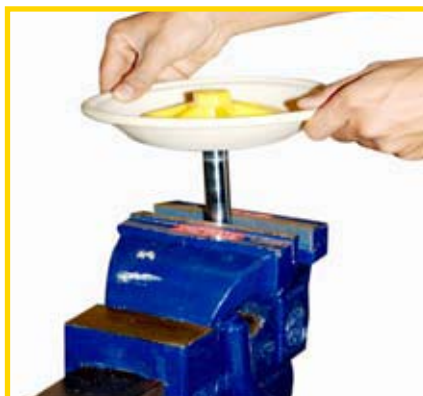
STEP 13 (Fig 14)

To remove diaphragm assembly from shaft, secure shaft with soft jaws (a vise fitted with plywood or other suitable material) to ensure shaft is not nicked, scratched, or gouged. Using an adjustable wrench or by hand, remove diaphragm assembly from shaft. Inspect all parts for wear and replace with genuine PRICE parts if necessary. (Fig 14)