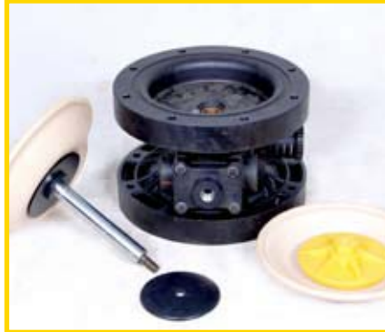
STEP 12 (Fig 12)

Using an adjustable wrench, or by rotating the diaphragm by hand, remove the diaphragm assembly. (Fig 11)