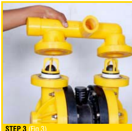
STEP 3 (Fig 3)

Remove the two small clamp bands which fasten the suction manifold to the liquid chambers. (Fig 5)