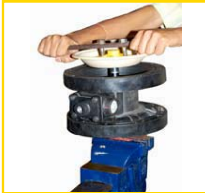
STEP 1 (Fig 1)

Fix the lock nut (outer piston) on the vice. Remove the locknuts (outer piston) with the help of a Bench vice.