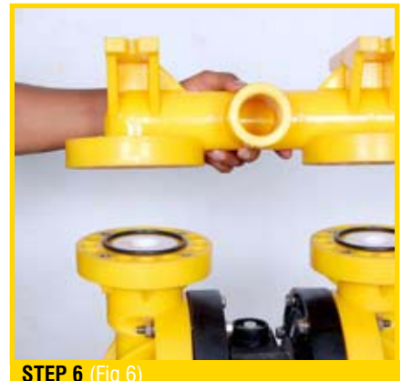
STEP 6 (Fig 6)

Lift away the discharge manifold to expose the valve balls and seats. (Fig 3)