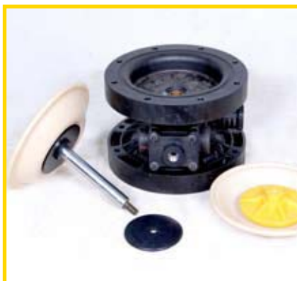
STEP 3 (Fig 3)

Remove the piston block from the shaft block and air cover. (Fig 6). There is no need to dismantle the air covers if there is no air leakage from the air covers. (Fig 6)