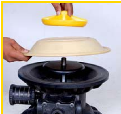
STEP 2 (Fig 2)

Remove pilot shaft by unscrewing two nylock nuts if found damage replace them. (Fig 5)