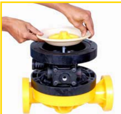
STEP 11 (Fig 11)

Lift liquid chamber away from center section to expose diaphragm and outer piston. (Fig 10)