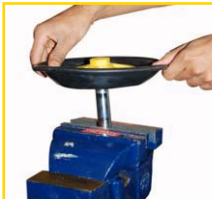
STEP 13 (Fig 14)

To remove diaphragm assembly from shaft, secure shaft with soft jaws (a vise fitted with plywood or other suitable material) to ensure shaft is not nicked, scratched, or gouged. Using an adjustable wrench or by hand, remove diaphragm assembly from shaft. Inspect all parts for wear and replace with genuine PRICE parts if necessary. (Fig 14)