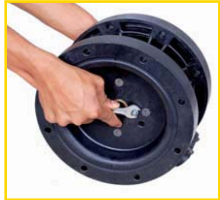
STEP 4 (Fig 4)

Fix the lock nut (outer piston) on the wise. Remove the locknuts (outer piston) with the help of a Bench vice.