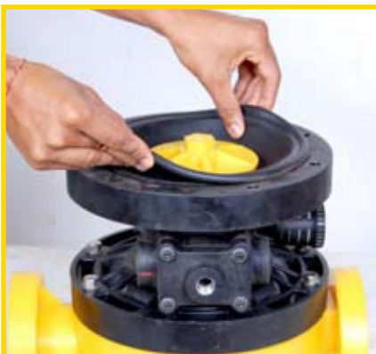
STEP 11 (Fig 11)

Lift liquid chamber away from center section to expose diaphragm and outer piston. (Fig 10)