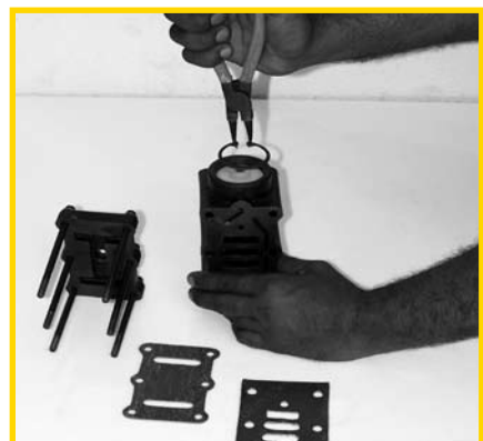
STEP 6 (Fig 6)

Now check the centre block i.e. air valve with air cover Take out main shaft, replace If worn out or scored. Check shaft block bush 'O' rings, replace If worn out. (Fig 4)