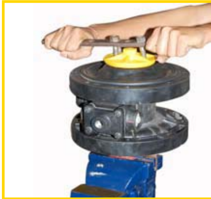
STEP 1 (Fig 1)

Fix the lock nut (outer piston) on the wise. Remove the locknuts (outer piston) with the help of a Bench vice.