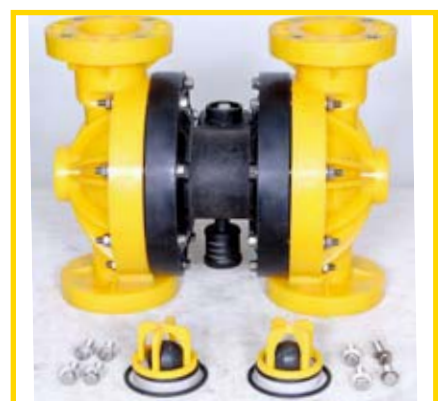
STEP 7 (Fig 7)

Remove the discharge valve balls, O-rings and seats (Fig 4) from the liquid chambers and inspect for nicks, gouges, chemical attack or abrasive wear. Replace worn parts with genuine PRICE parts for reliable performance.