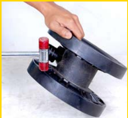
STEP 10 (Fig 10)

Take out the piston block cap by using mounting bolts. Check the cap with 'O' ring. (Fig 8)