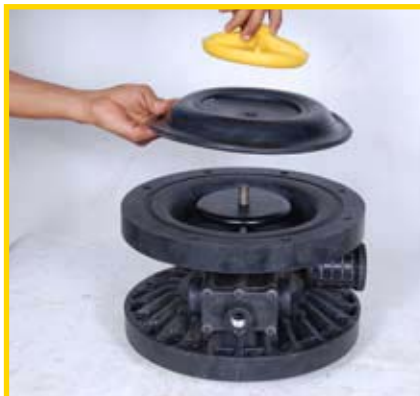
STEP 2 (Fig 2)

Remove pilot shaft by unscrewing two nylock nuts if found damage replace them. (Fig 5)