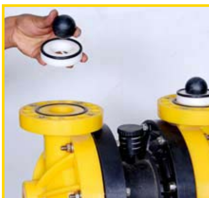
STEP 4 (Fig 4)

Lift suction manifold from liquid chambers and centre section to expose suction valve balls and seats. Inspect ball cage area of liquid chamber for excessive wear and damage. (Fig 6)