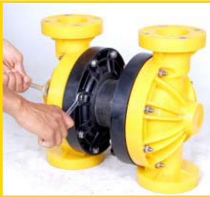
STEP 9 (Fig 9)

Remove one set of large clamp bands, which secure one liquid chamber to the center section. (Fig 9)