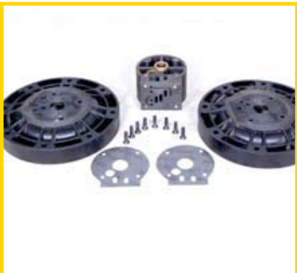
STEP 12 (Fig 12)

Unscrew the allen bolts to remove the air cover.