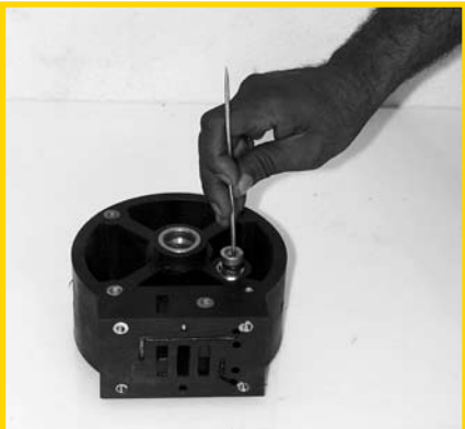
STEP 11 (Fig 11)

Remove the piston and check it. Replace it if worn out. (Fig 3)