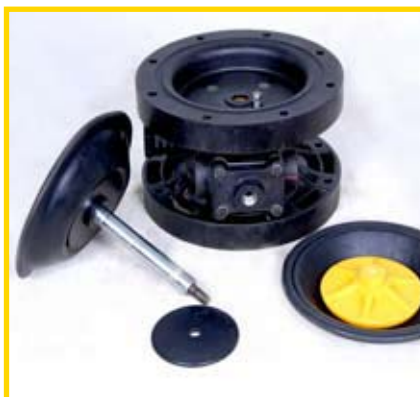
STEP 3 (Fig 3)

Remove the piston block from the shaft block and air cover. (Fig 6). There is no need to dismantle the air covers if there is no air leakage from the air covers. (Fig 6)