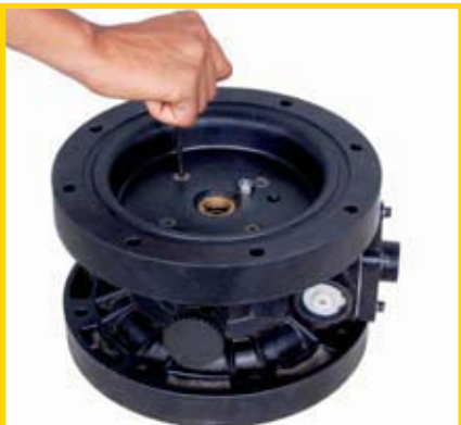
STEP 9 (Fig 9)

Remove the pilot shaft bushes and check it. Check the O rings, replace if worn out. (Fig 12)