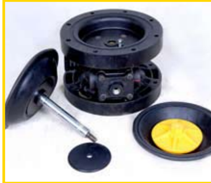
STEP 12 (Fig 12)

Using an adjustable wrench, or by rotating the diaphragm by hand, remove the diaphragm assembly. (Fig 11)