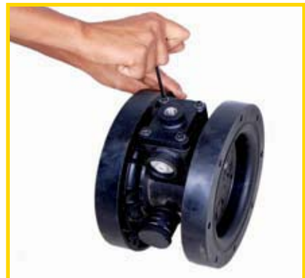
STEP 5 (Fig 5)

Remove the diaphragm & lock nut If diaphragm are damaged replace them (always replace both the diaphragm). (Fig 3)