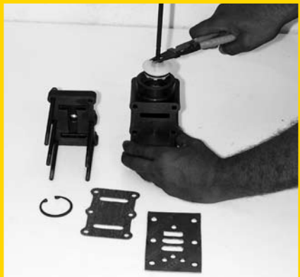
STEP 7 (Fig 7)

For assembly, follow the reverse procedure.