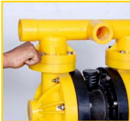
STEP 2 (Fig 2)

Before starting disassembly, mark a line from each liquid chamber to its corresponding air chamber. This line will assist in proper alignment during reassembly. (Fig 1)