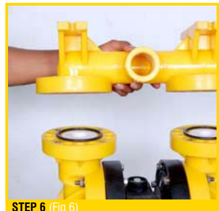
STEP 6 (Fig 6)

Lift away the discharge manifold to expose the valve balls and seats. (Fig 3)