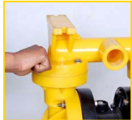
STEP 5 (Fig 5)

Utilizing a wrench, remove the two small clamp bands that fasten the discharge manifold to the liquid chambers. (Fig 2)