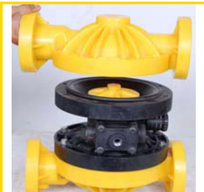
STEP 10 (Fig 10)

Remove one set of large clamp bands, which secure one liquid chamber to the center section. (Fig 9)