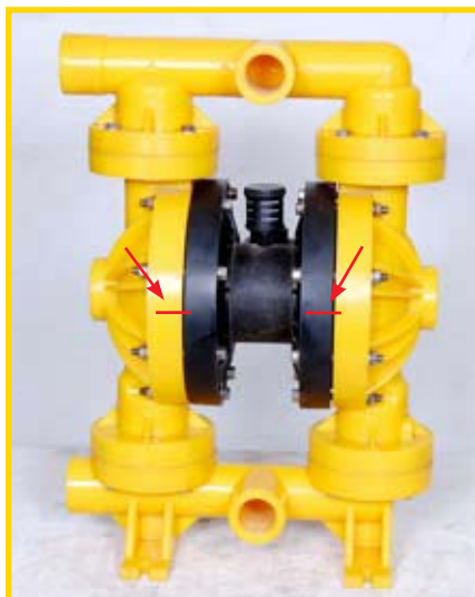
STEP 1 (Fig 1)

Before starting disassembly, mark a line from each liquid chamber to its corresponding air chamber. This line will assist in proper alignment during reassembly. (Fig 1)