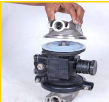
STEP 8 (Fig 8)

NOTE: Due to varying torque values, one of the following two situations may occur: 1) The lock nut (outer piston), diaphragm and holding plate (inner piston) remain attached to the shaft and the entire assembly can be removed from the center section (Fig 10). 2) The lock nut (outer piston), diaphragm and holding plate (inner piston) separate from the shaft which remains connected to the opposite side diaphragm assembly (Fig 10). Repeat disassembly instructions for the opposite liquid chamber. Inspect diaphragm assembly and shaft for signs of wear or chemical attack. Replace all worn parts with genuine PRICE parts for reliable performance.