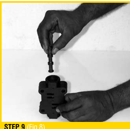
STEP 9 (Fig 8)

Remove the piston block cap, check the o-rings. Replace if damaged.(Fig 7)