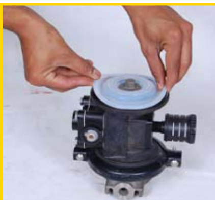
STEP 9 (Fig 9)

Lift liquid chamber away from center section to expose diaphragm and outer piston. (Fig 8)