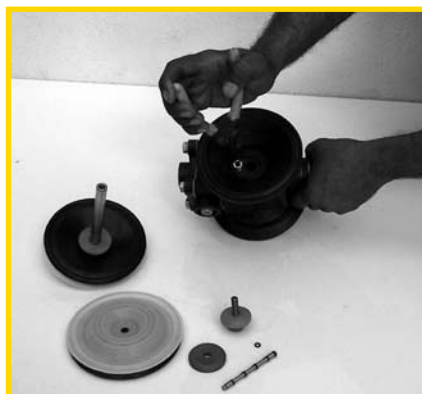
STEP 4 (Fig 4)

Remove the locknuts with the help of a spanner.