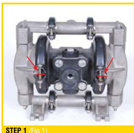
STEP 1 (Fig 1)

Before starting disassembly, mark a line from each liquid chamber to its corresponding air chamber. This line will assist in proper alignment during reassembly. (Fig 1)