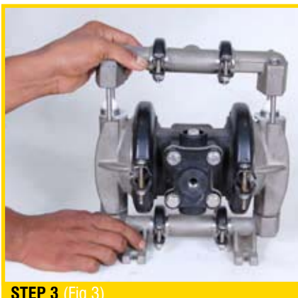
STEP 3 (Fig 3)

Inspect ball cage area of liquid chamber for excessive wear and damage. (Fig 6) Remove the discharge valve balls, O-rings and seats (Fig 7) from the liquid chambers and inspect for nicks, gouges, chemical attack or abrasive wear. Replace worn parts with genuine PRICE parts for reliable performance.