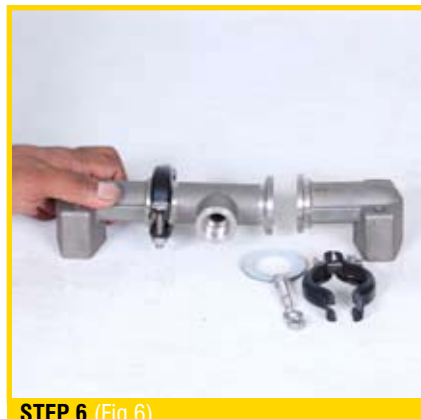
STEP 6 (Fig 6)

Lift away the discharge manifold to expose the valve balls and seats. (Fig 3)