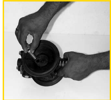
STEP 5 (Fig 5)

Remove all wetted parts from the centre block. (Fig 2)