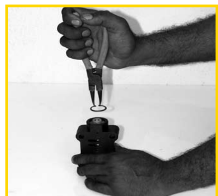
STEP 7 (Fig 6)

Unscrew the pilot shaft bush if required by removing one circlip. Check the bush. Replace it if worn out or damaged. (Fig 4)