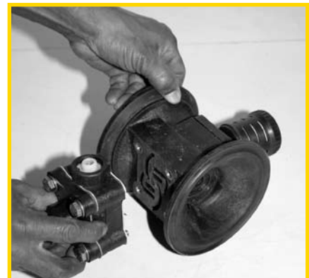
STEP 6 (Fig 6)

Remove the main shaft and check it. Remove the pilot shaft. Check it. Replace it if worn out. (Fig 3)