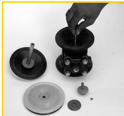
STEP 3 (Fig 3)

Remove the pilot shaft bush. Check the o-rings. Replace if worn out. (Fig 5)