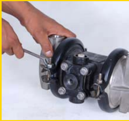
STEP 7 (Fig 7)

Remove one set of clamps, which secure one liquid chamber to the center section. (Fig 7)