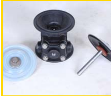
STEP 10 (Fig 10)

Remove one set of clamps, which secure one liquid chamber to the center section. (Fig 7)