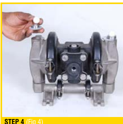
STEP 4 (Fig 4)

Before starting disassembly, mark a line from each liquid chamber to its corresponding air chamber. This line will assist in proper alignment during reassembly. (Fig 1)