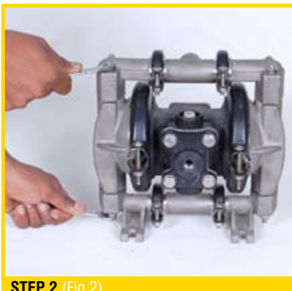
STEP 2 (Fig 2)

Utilizing a wrench, remove the studs that fasten the discharge manifold to the liquid chambers. (Fig 2)