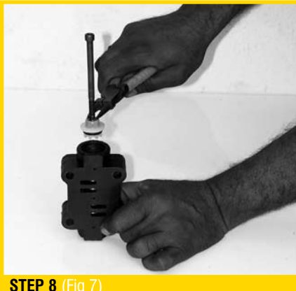
STEP 8 (Fig 7)

For assembly, follow the reverse procedure.