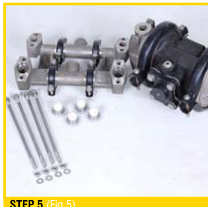
STEP 5 (Fig 5)

Utilizing a wrench, remove the studs that fasten the discharge manifold to the liquid chambers. (Fig 2)