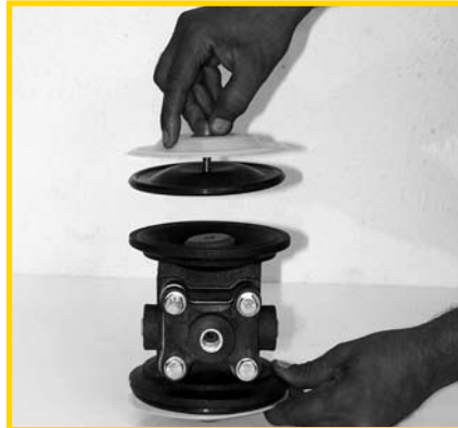
STEP 2 (Fig 2)

Remove all wetted parts from the centre block. (Fig 2)