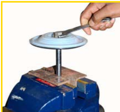
STEP 11 (Fig 11)

Using an adjustable wrench, or by rotating the diaphragm by hand, remove the diaphragm assembly. (Fig 9)