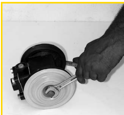
STEP 1 (Fig 1)

Remove the locknuts with the help of a spanner.